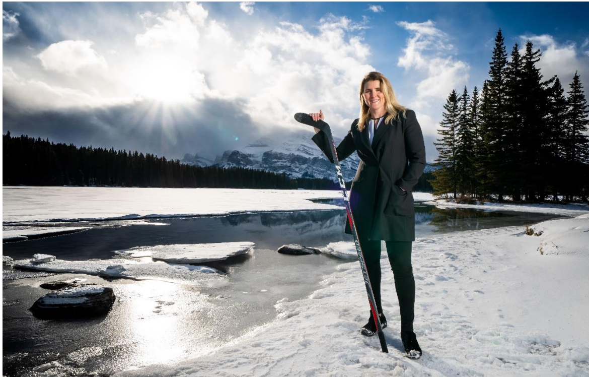
Dr. Hayley Wickenheiser